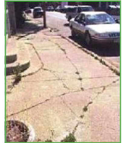
Sidewalk conditions before the project.

The areas surrounding the business district didn't have any sidewalks and many of the roads had no storm sewers or curbs, which caused the shoulders to often be muddy and filled with runoff. These roads led to an elementary school, a local park, and three restaurants. It became a priority to attempt to transform this into an accessible and safe area for pedestrians, especially children. The addition and replacement of sidewalks increased the walkability and aesthetic value of the downtown area but didn't provide pedestrian amenities. To fix these problems 61 decorative street lamps were added to the downtown village area to promote