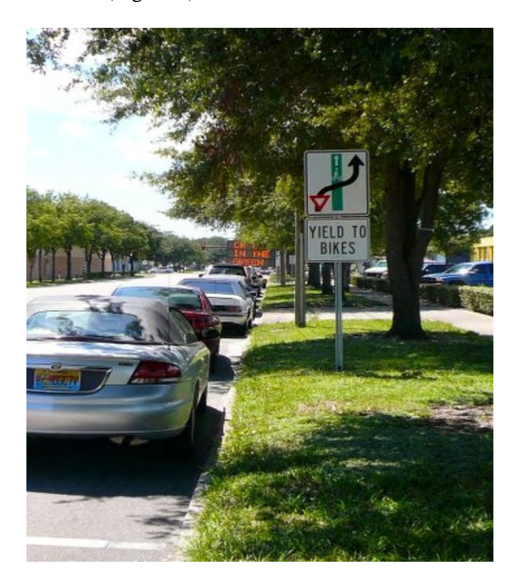
Figure 3. Sign assembly used in the vicinity of the green bike lane weaving area.

A sign assembly similar to those used in Portland, Oregon, in their blue bike lane installations (but substituting green for blue on the main sign) was installed at the start of the green bike lane weaving area. The green color was chosen to match the recommendation of FHWA, which recommended that further testing with colored bike lanes use green, since blue is associated with another meaning in pavement marking contexts (Figure 3).