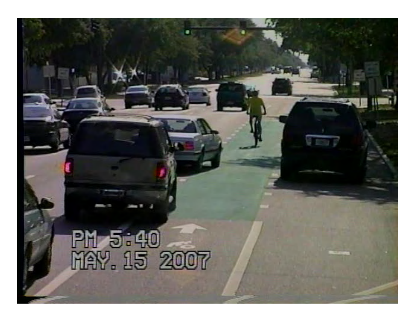
Figure 7. Motor vehicle-motor vehicle conflict.