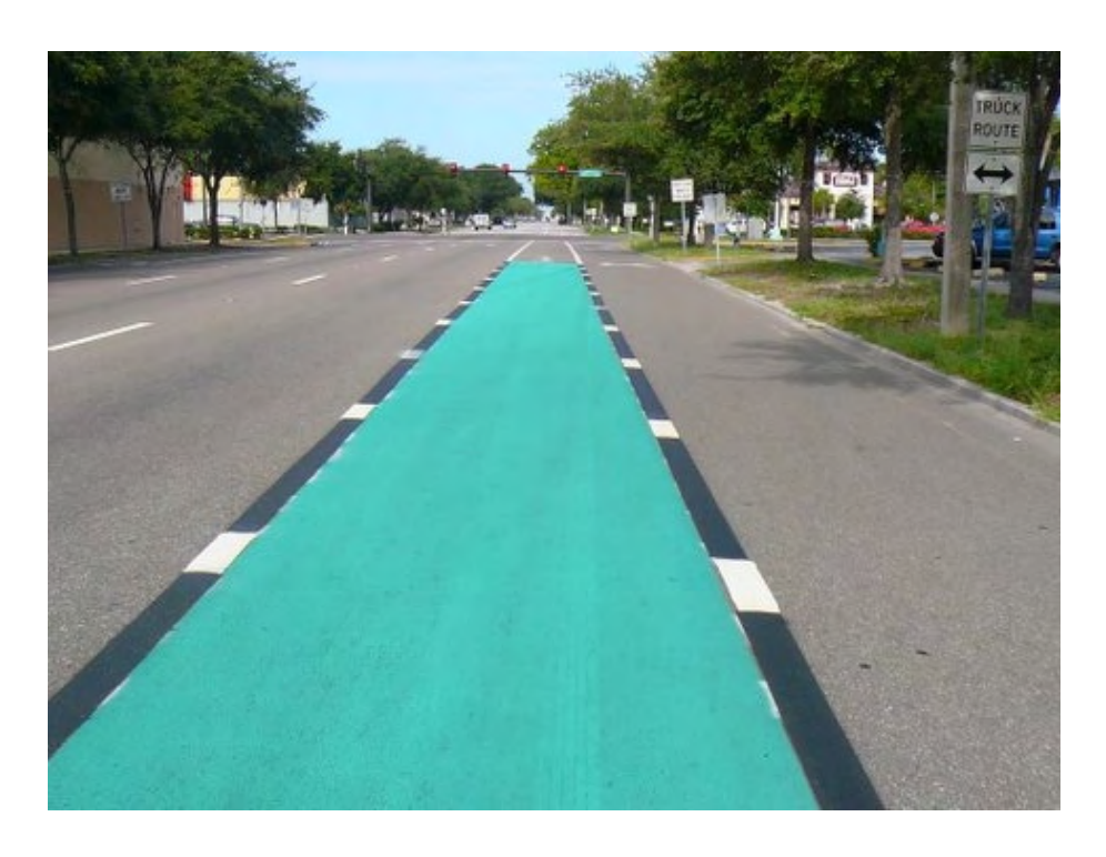
Figure 4. Black mini-stripes added to border of green bike lane weaving area.

The variable message board (Figure 5) was used again in the same location, and the following message was displayed in two panels: "YIELD TO BIKES AND CROSS IN GREEN." The sign assembly was moved about 65 feet into the green weaving area, and another sign assembly was located 270 feet in advance of the green weaving area. All upgrades were completed on August 20, 2007, including another press release, and this was the start of the After 2 period, referring to the application of the black mini-stripes and additional signage.