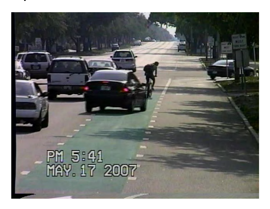
Figure 6. Bicycle-motor vehicle conflict.

While the percentage of conflicts (sudden changes in speed or direction, Figures 6 and 7) was lower in the after period, the differences were not statistically significant. It should be noted that most of the conflicts were between motorists maneuvering near the bicyclists.