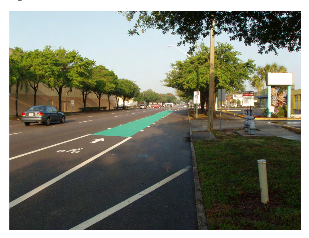
Figure 2. First "after" condition for green bike lane weaving area.