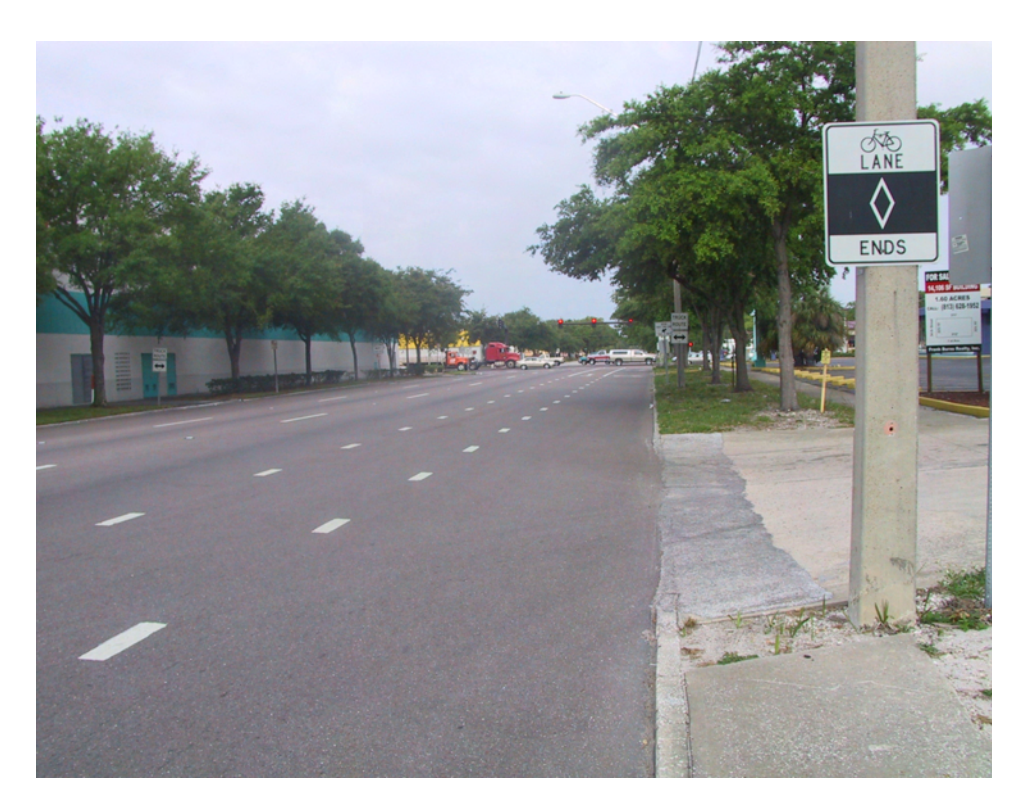
Figure 1. Cross-section and "before" condition.