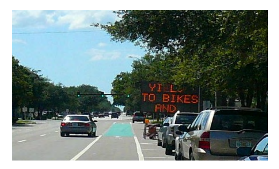
Figure 5. Use of variable message board.

The variable message board (Figure 5) was used again in the same location, and the following message was displayed in two panels: "YIELD TO BIKES AND CROSS IN GREEN." The sign assembly was moved about 65 feet into the green weaving area, and another sign assembly was located 270 feet in advance of the green weaving area. All upgrades were completed on August 20, 2007, including another press release, and this was the start of the After 2 period, referring to the application of the black mini-stripes and additional signage.