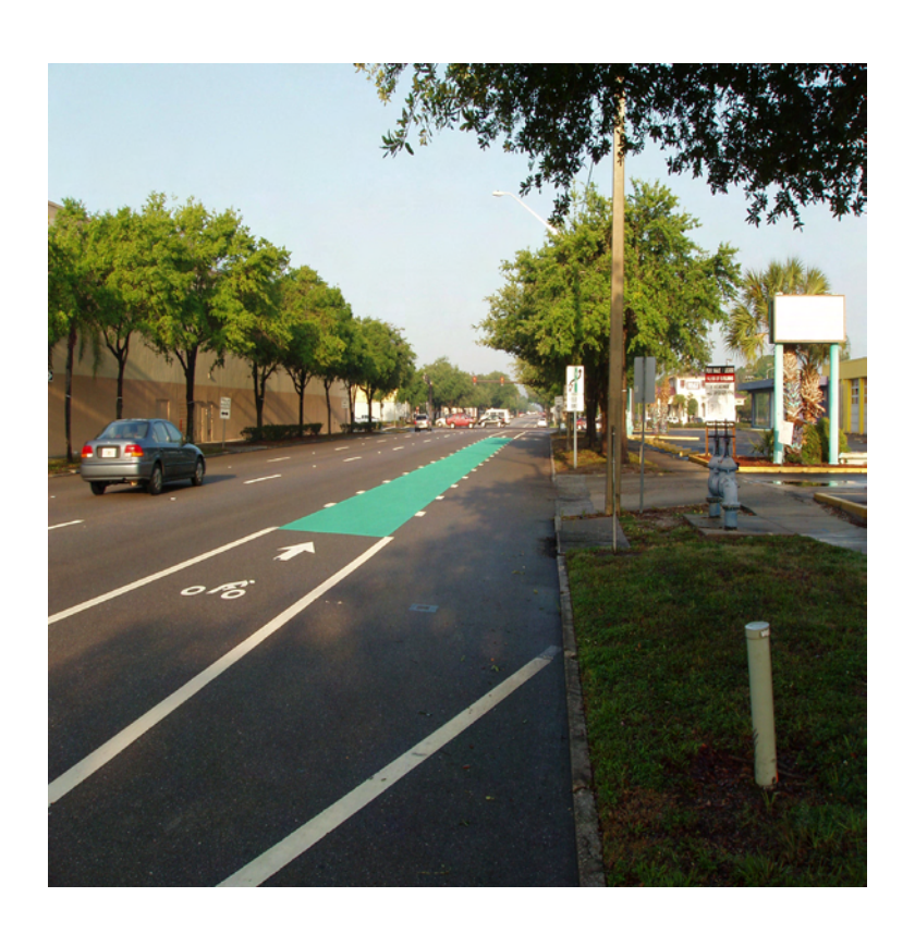
FDOT Contract BA784 Final Report

University of North Carolina Highway Safety Research Center