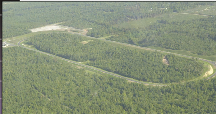
Figure 2. Aerial View of the Accelerated Loading Pavement Study Test Site in Alabama

In the study, 45 61-meter (200-foot) sections of flexible pavements were installed at a 2.7-kilometer (1.7-mile) test track, using a variety of materials and methods unique to section sponsors. The National Center for Asphalt Testing then simulated 10 to 15 years of truck traffic in a 2-year period. This facility is expected to clarify the relationship between methods and performance so that future design and construction policy can be objectively guided by life cycle costs.