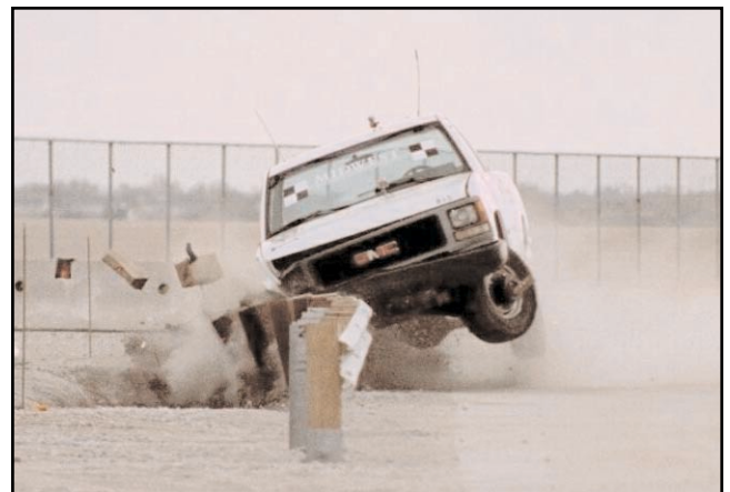
Figure 3. Crash Test at the Midwest Roadside Safety Facility

For the Midwest States Pooled Fund Crash Test Program (SPR-3(017)), the MwRSF crash tests highway roadside appurtenances to ensure that they meet national criteria. Although the project was proposed originally as a Midwest study, partners include Connecticut, Florida, and Montana.