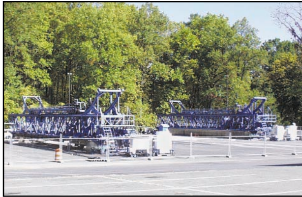
Figure 1. Pavement Testing Facility at TFHRC

The Full-Scale Accelerated Performance Testing for Superpave® and Structural Validation Project (TPF-5(019)) is an example of an FHWA-led TPF study with 11 State DOT partners. The experiment focuses on developing field performance data on hot-mix asphalt mixtures with modified binders. This is an important step in a larger program to refine the Superpave binder specification for the modified materials. Secondary goals include early trials of the proposed American Association of State Highway and Transportation Officials (AASHTO) Guide for Design of New and Rehabilitated Pavement Structures, evaluation of crumb-rubber modified asphalt pavements, and correlation of field performance with results of laboratory tests such as the Superpave simple performance test.